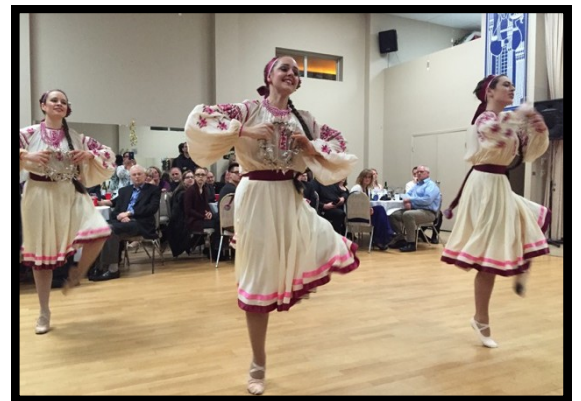
Tropak performing at our Malanka this year.

Come and see us perform next at B.C.'s largest Ukrainian Cultural Festival on May 7, 2016 .