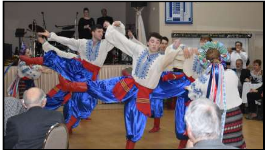
Guest were treated to a traditional dance by Dovbush Ukrainian Dancers