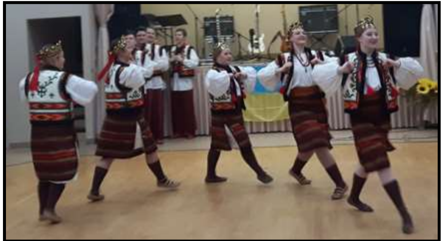
Kvitka Dancers Group performing a traditional Ukrainian dance routine

Our Society was pleased to support and volunteer at the Ukrainian Community Night, a memorable and enjoyable event for all those present.