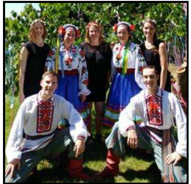
Tropak and Vostok at Coquitlam's Kaleidoscope Festival in July 2016

Now Tropak is back in the studio, preparing tirelessly for their next performance: Malanka 2017!