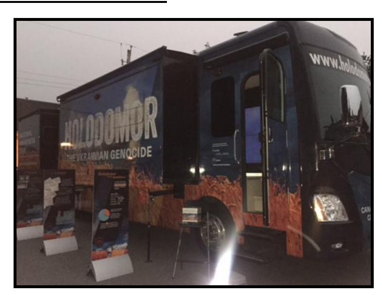
Holodomor Bus at Ivan Franko Centre

The Tour featured the Holodomor Mobile Classroom, a state-ofthe-art, interactive mobile learning space to engage and educate students and the public. Several films on the Holodomor played throughout the hours it was open to the