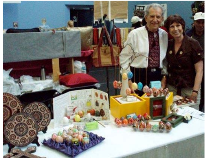
A rich display of pysanky and Ukrainian wood carving at the Canada Day Salmon Festival 2008.