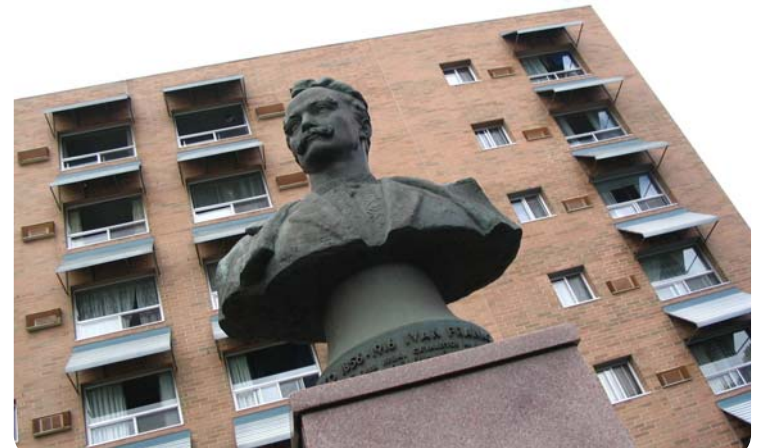
The Ivan Franko Manor at 200 McGregor Street in Winnipeg houses a wonderful museum dedicated to our society's namesake. If you're planning to be in the area, phone 204.589.4949 for information.