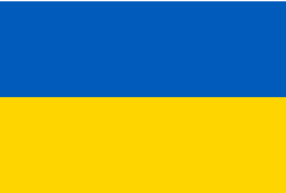
National Flag of Ukraine

The first national flag for Ukraine was adopted in 1848 by revolutionaries who wanted its western parts to be freed from Austro-Hungarian rule. They based their flag, consisting of equal horizontal stripes of yellow over blue, on the colours of the coat of arms used by the city of Lviv. The arms showed a golden lion on a blue shield, an emblem dating back many centuries. In 1918 the decision was made to reverse the stripes of the 1848 flag to reflect the symbolism of "blue skies over golden wheat fields." On January 28, 1992, Sovereign Ukraine officially adopted the blue and yellow flag.