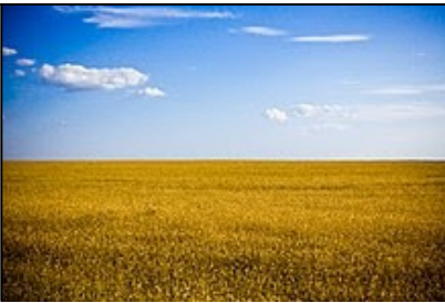
Typical agricultural landscape in the Kherson Region of Ukraine.